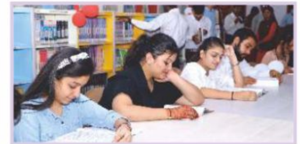
Library with e-resources