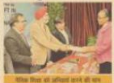
मिडिल क्लास को जलियां करने की धमकी