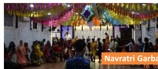
Navratri Garba Raas