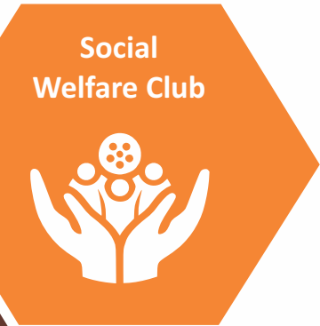
Social Welfare Club

Through practical experiences and meaningful community involvement, the Social Welfare Club enables students to advance social justice.