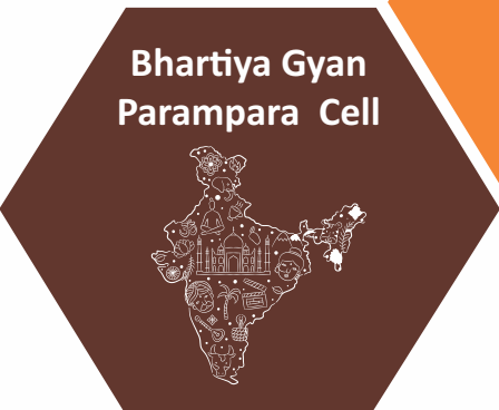
Bhartiya Gyan Parampara Cell

The Bhartiya Gyan Parampara Cell works to preserve India's cultural heritage through teaching and workshops that merge ancient knowledge with contemporary methods.