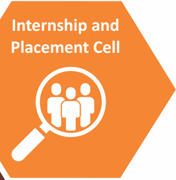
Internship and Placement Cell

The Internship & Placement Cell brings together business organizations along with educational institutions in order to offer students with both development that's professional while at the same time giving out networking opportunities and preparing them for successful careers.