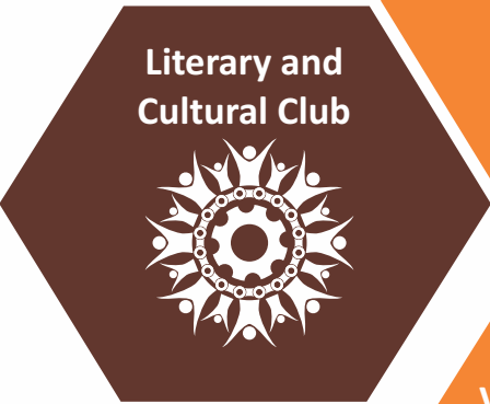
Literary and Cultural Club

The Cultural Club employs music, art as well as dance so as to celebrate diversity while at the same time encouraging creativity along with inclusivity and also connecting students to their cultural roots.