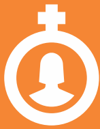
Women's Cell Pink Ribbon Club

The Women's Cell provides empowerment opportunities through mentorship and self-defense alongside awareness programs while the Pink Ribbon Club leads efforts to raise awareness for women's health and breast cancer.