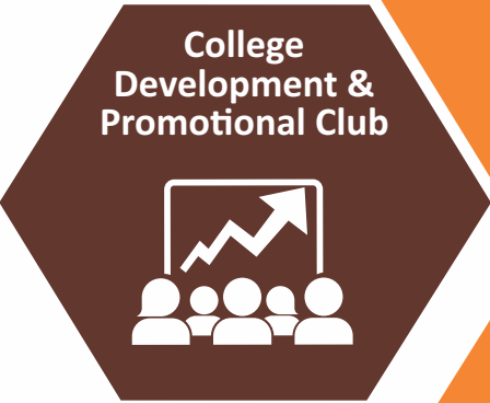
College Development & Promotional Club

The College Development & Promotional Club advances institutional goals by increasing visibility while building partnerships and developing recruitment and community engagement strategies.