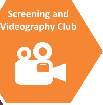
Screening and Videography Club

The Screening and Videography Club makes use of provocative screenings in order to nurture creativity and cultural absoluteness, while at the same time promoting conversations and teamwork that are meaningful.